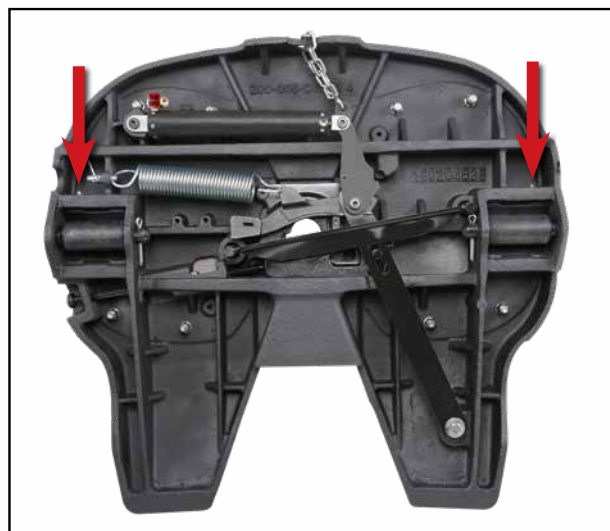
Figure 1: Underside view, lubrication points of Fontaine Armor

Inspect the top surface of the fifth wheel to make sure it is properly greased. A liberal coating of grease