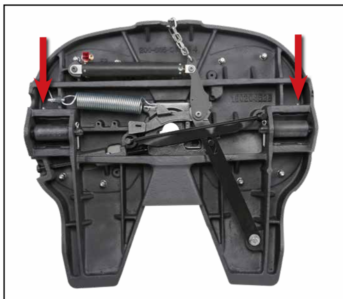
Figure 2: Underside view, Lubrication points of Fontaine Armor